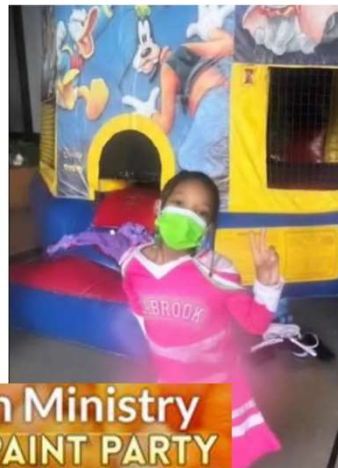
Next Gen Ministry PUMPKIN PAINT PARTY