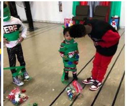
Brunch with St. Nick